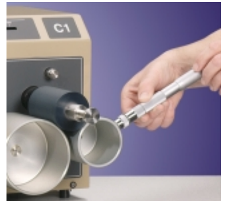
Applying ink with the IGT ink pipette

The inking unit consists of two driven aluminium drums and a top roller. The distribution of the ink only takes about 30 seconds thanks to the diameter ratio and the oscillating drum movement. The inking time of the printing disc is about 15 seconds.