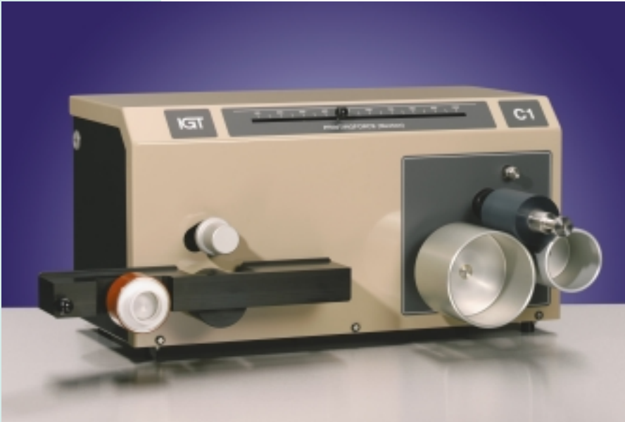
The C1, ready for use