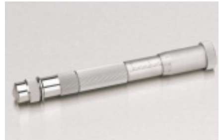
The IGT ink pipette

The use of an IGT ink pipette is strongly recommended because it increases the accuracy of application of ink and therefore the inking, thereby enhancing the performance of the tests.