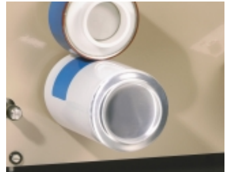
Making a print on a metal can