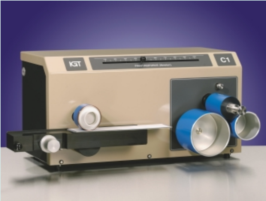
Making a print

Paper, board, plastic film, cellophane, laminate, metals, etc.